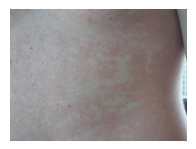
Fig. 3 Representative photograph of erythema marginatum, a transient reticular rash that sometimes appears as a prodrome to hereditary angioedema attacks

may have more rapid onset [8, 14]. Abdominal attacks can be excruciatingly painful and can result in unfortunate consequences such as narcotic dependency or unnecessary surgery [9, 15]. Laryngeal attacks are potentially fatal and are the most feared site of involvement [2].