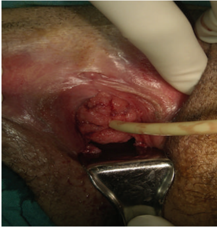
FIGURE 1: GCA was detected that completely surrounded the external urethral orifice.