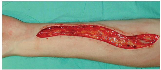
Figure 4: Harvesting of a vein graft from the forearm. The short proximal stem of the thoracodorsal axis graft did not allow it to be attached to the external carotid artery. Thus, a vein-graft was harvested from the forearm for interpositional-use