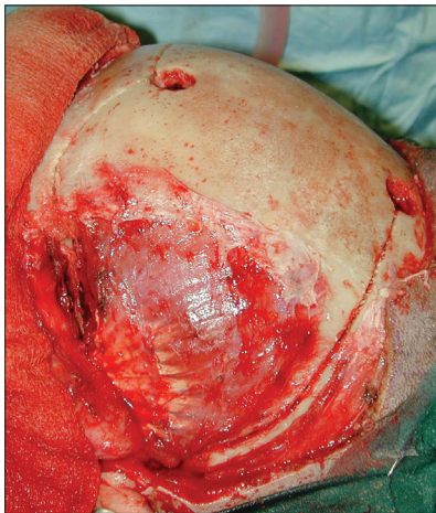
Figure 2: A pericranial flap was raised using bicoronal incisions and the left temporalis muscle exposed. A large craniotomy was performed to allow 'pedicling' of the bone flap on the left temporalis muscle. A large craniotomy was performed to allow 'pedicling' of the bone flap on the left temporalis muscle