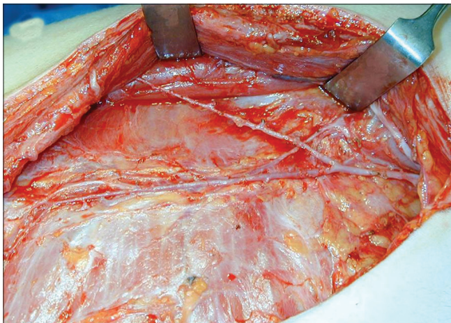
Figure 3: The thoracodorsal axis artery-graft harvested with an extensive intramuscular dissection allowing both the latissimus dorsi and serratus anterior branches to be obtained