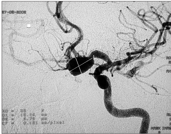
Figure 1: Cerebral angiogram shows the large aneurysm (1.5x1 cm) affecting the anterior communicating artery and proximal stems of anterior cerebral arteries