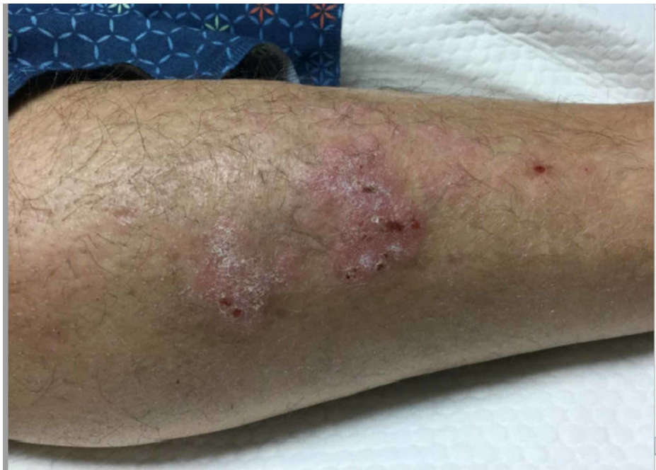
FIGURE 1: Erythematous skin rash on patient's left upper extremity

Electrocardiography (EKG) showed normal sinus rhythm, without significant ST elevation (Figure 2). Labs showed leukocytosis of 18,200/ \mu L (4,000-10,800/ \mu L) with normal hemoglobin and platelets count on a complete blood count (CBC). The coagulation panel was unremarkable. Cardiac troponin came back elevated at 2.62 (0.00-0.04 ng/ml), trended up subsequently to 9.08 ng/ml and peaked at 15.59 ng/ml, and then decreased within 24 hours from initial presentation.