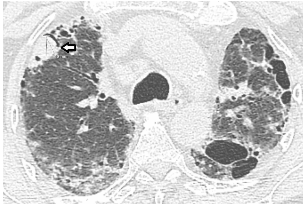
FIGURE 3: CT scan of chest without contrast demonstrating a mycetoma (left arrow) along with diffuse fibrotic changes.