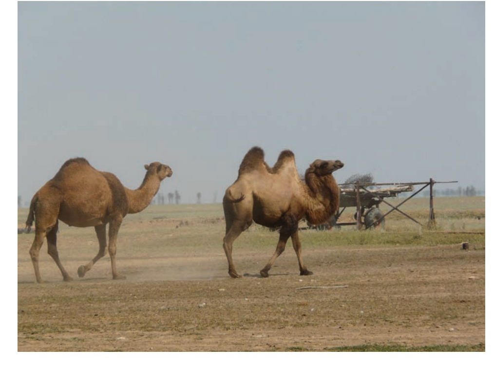
Figure 1. The two main large camelids: Camelus dromedarius and Camelus bactrianus.

It is difficult to have statistics regarding the infection rate among camel farms' staff but, at least in the Middle East, where MERS outbreak was observed among the staff working with camel (shepherds, staff in slaughterhouses and camel market, and camel milk plant), the host-pathogen interaction, host immune responses, and pathogen immune evasion strategies could be better understood and may help for setting up anti-COVID-19 vaccine (Prompetchara et al., 2020).