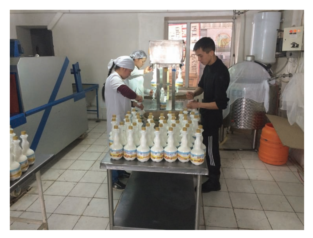
Figure 4. Increasing demand in camel milk for its suspected immune-protective effect against COVID-19.

The MERS-CoV is a beta coronavirus like SARS-CoV-1 and SARS-CoV-2 causing similar symptoms in humans (fever and respiratory problems). The infection in