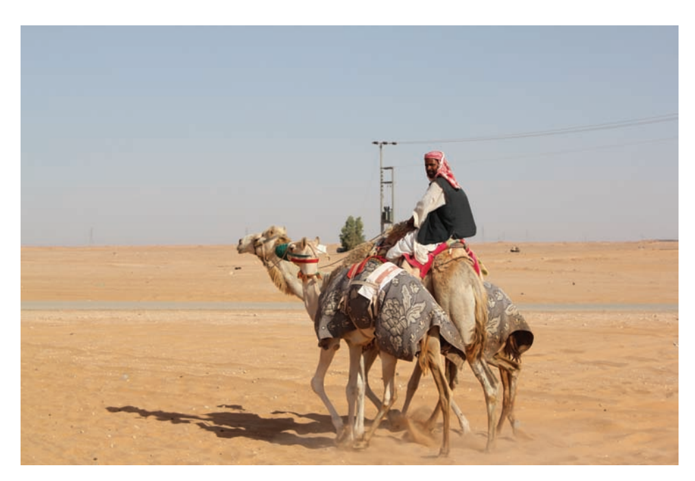
Figure 3. Camel used for racing in Saudi Arabia.

The hypothesis of cross-immunity between MERS-CoV and SARS-CoV-2 seems to be justified (Yaqinuddin, 2020).