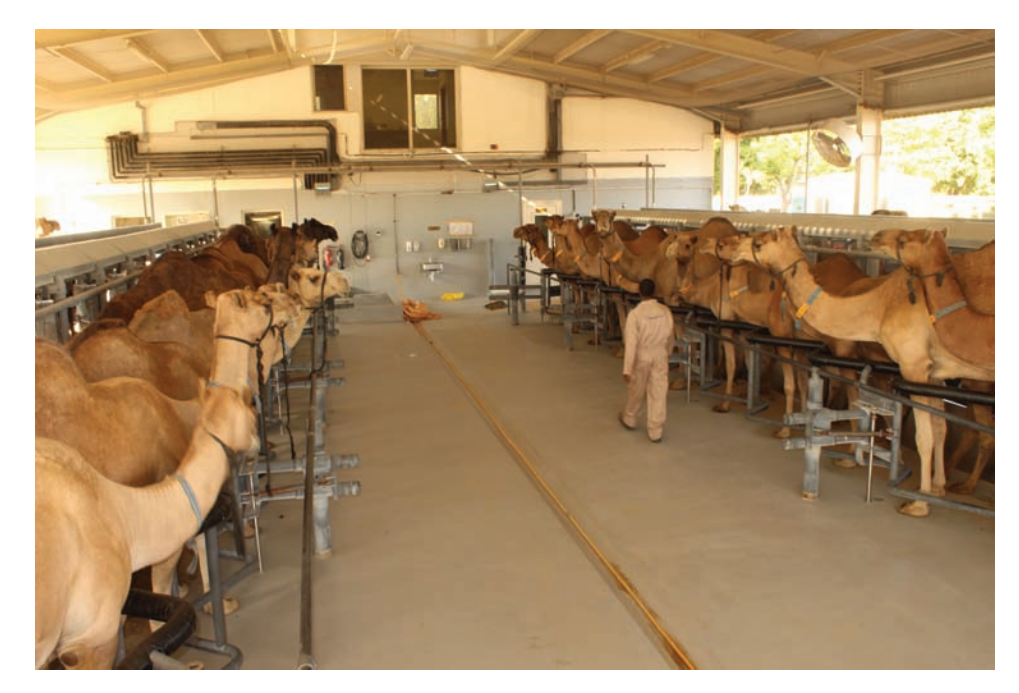
Figure 2. Dromedaries in milking parlor in intensified camel farming