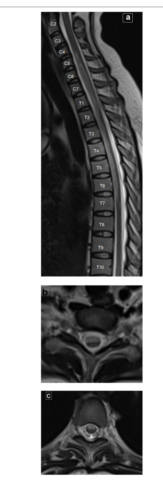
FIGURE 2 | MRI of the spine. (a) Sagittal T2-weighted image of the whole spine shows extensive long hyperintense signal extending from C5 to T7, (Continued)

FIGURE 2 | associated with mild cord swelling. ( b , c ) Axial T2-weighted images at the cervical and dorsal levels, respectively, showing the hyperintense signal occupying the anterior two thirds of the cord, bilaterally (with involvement of both the gray and white matter).