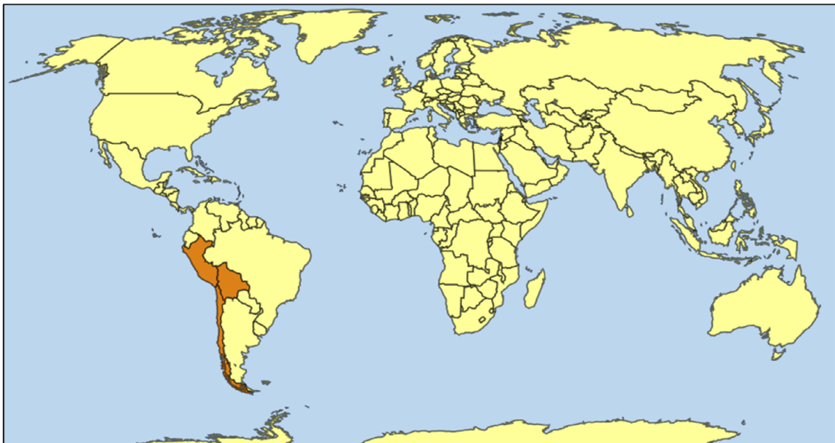
Figure 2: Global distribution of Amathynetoides nitidiventris

A. nitidiventris is distributed in Peru (EFSA PLH Panel, 2021), Bolivia and northern Chile (Morrone, 1994) (Figure 2). Since ulluco is the only host of A. nitidiventris , the pest could be present in other neighbouring countries where ulluco is cultivated (López and Hermann, 2004; Manrique et al., 2017).