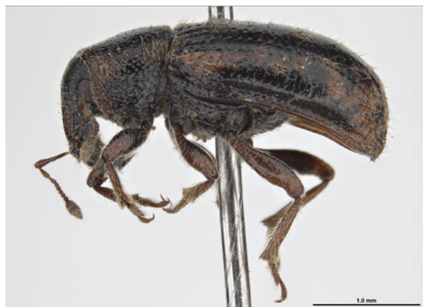
Figure 1: Side view of adult Amathynetoides nitidiventris