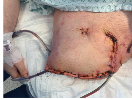
FIGURE 1: Partially closed amputation stump with drains in place (first case).

Repeated debridement yielded persistence of positive tissue cultures with Mucor circinelloides and regional progression of superficial and deep soft tissue necrosis and perineal cellulitis. Given the lack of clinical improvement, adjunctive therapies were added on Day 23: systemic anidulafungin (100 mg daily for 20 days) and local conventional amphotericin B wound dressings (75 mg =1 mg/kg body