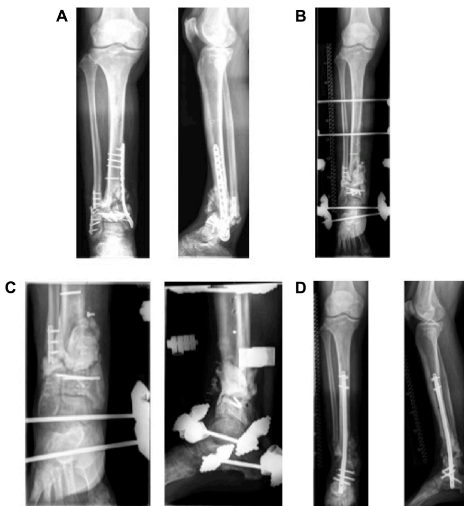
Figure 1 Treatment of an infectious nonunion by means of the Masquelet technique.

The criteria for an infection were a sinus tract, pus intraoperatively, or at least three positive signs just mentioned. During surgery, an intraoperative swab of the wound, as well as one to three tissue samples, were taken directly adjacent to the