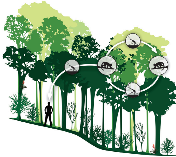
Fig. 5: in some conditions, Anopheles (Kerteszia) cruzii may bite both at the canopy of the trees and close to the ground, which may favour the transmission of simian plasmodia to human in the wild or in the close vicinity of the forest.

2011, Tanizaki et al. 2013) as well as in Europe, Oceania and North America [for review, see Müller and Schlagenhauf (2014)]. To our knowledge, there is no record of P. knowlesi cases in Africa or Central and South America.