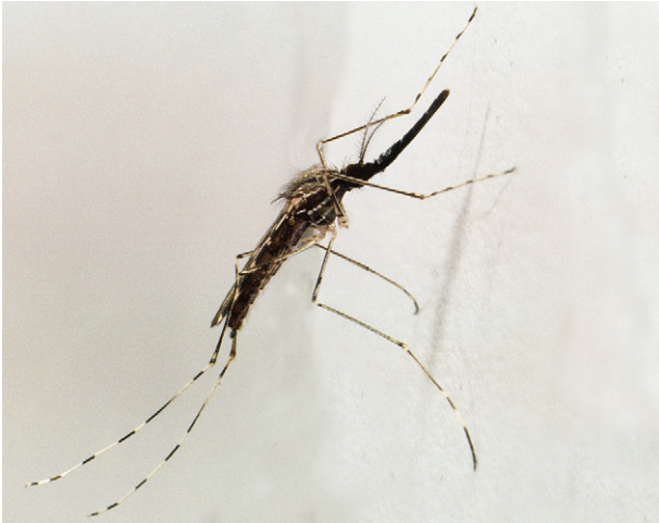
Fig. 3: Anopheles (Kerteszia) cruzii , the mosquito vector of both the human and simian malarias in the Atlantic Forest of southern and southeast Brazil.