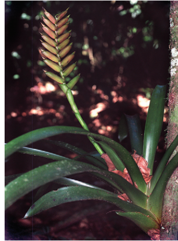
Fig. 4: the malaria vector Anopheles (Kerteszia) cruzii breeds in water accumulated in the axils of shaded and epiphyte bromeliads, such as Vriesea sp.