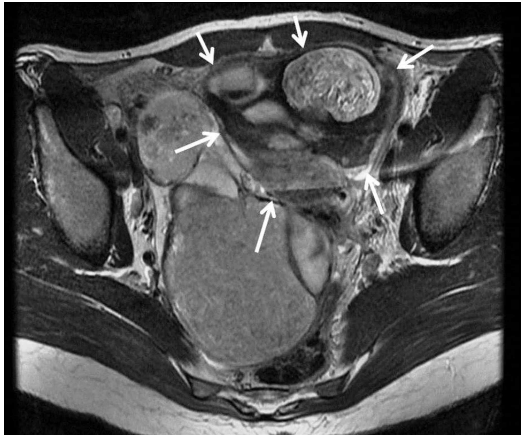
FIGURE 2: Magnetic resonance imaging scan of the pelvis

View demonstrating a large thin-walled dermoid cyst of the left ovary