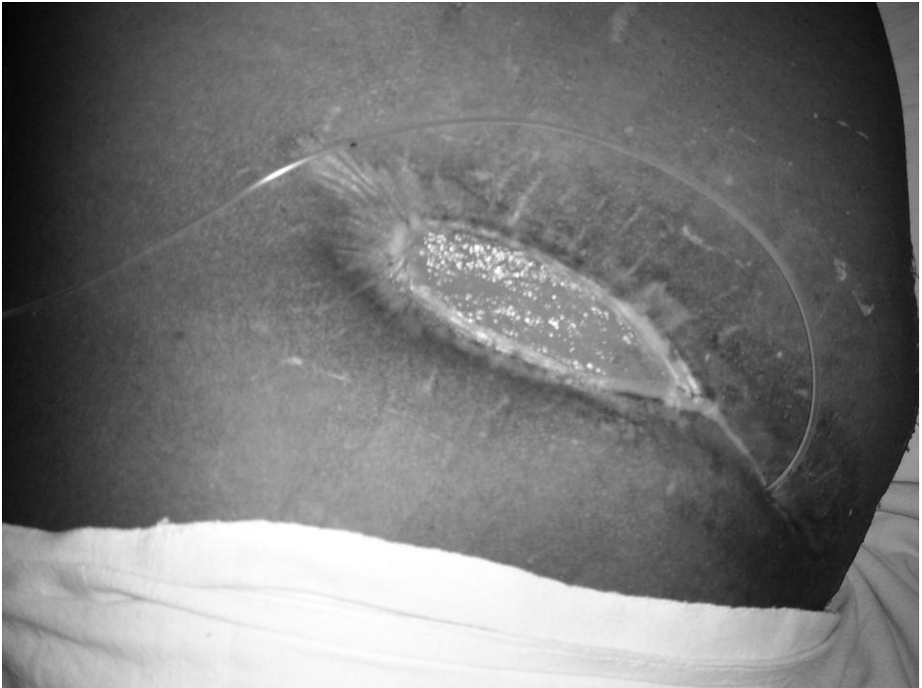
Figure 1 Enterocutaneous fistula at the medial end of the wound.