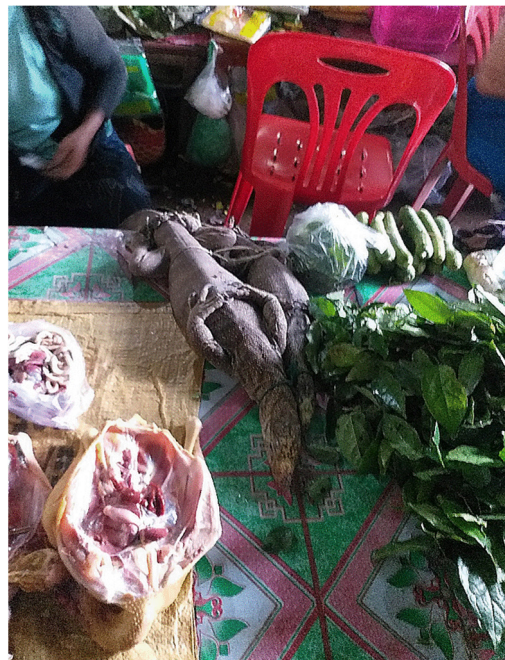
Figure 1. Live monitor lizard sold at a local wet market in the Lao PDR.

Infection of A. cantonensis is typically associated with the consumption of an undercooked or uncooked (raw) host species, predominantly molluscs, but also frogs, centipedes, crustaceans, fish and lizards [6,12–15]. Consumption of raw protein dishes is common in the Lao PDR and not only include fish [16] but also snails (in a dish called 'koi hoi') and lizard. Monitor lizards can routinely be observed being sold at wet markets in the Lao PDR (Figure 1), with estimates putting typical yearly trade at 4536 individual lizards per market [17,18]. Monitor lizards of the genus Varanus have been well documented as paratenic hosts for A. cantonensis . Yellow tree monitors ( V. bengalensis ) from across Thailand have been shown to be infected, with 95.5% of those sampled positive for A. cantonensis [19].