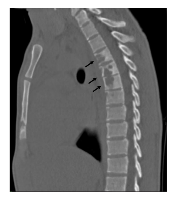
Figure 3: Reformatted sagittal CT scan image of the chest (bone window), showing extensive erosion involving the anterior aspect of three mid thoracic vertebral bodies (arrows). Note the subtle interrupted sclerotic margins as well as slight loss of height of the intervertebral disks in the affected segments.