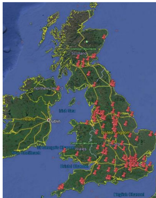
Figure 1 Geographical location of survey respondents (n=154). Each pin represents a single postcode (first three or four digits).

One hundred and fifty-six people completed the two mandatory questions (confirming that they were an occupational or physiotherapist and that they were currently clinically working with stroke survivors at any stage of their recovery in the UK). Two respondents'