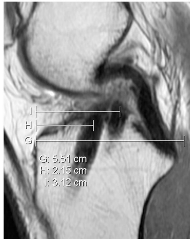
Figure 2 The maximum diameter of the tibia was measured from the sagittal images in millimeters (G) and the centers of the tunnels were determined from the anterior wall of the tibia (H, I).