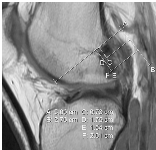
Figure 1 The maximum diameter of the femoral condyle was measured from the sagittal images parallel to and perpendicular to Blumensaat's line in millimeters (A, B) and the tunnel locations in the femur were measured from their own plane (FE, DC).

There were 56 male and 19 female participants in this study with a mean age of 32 years (standard deviation [SD] 10) and mean height and weight of 177 cm (SD 9) and 82 kg (SD 16),