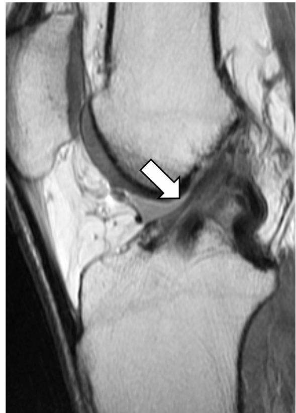
Figure 3 The arrow indicates a partially visible anteromedial graft in sagittal proton-density magnetic resonance imaging.