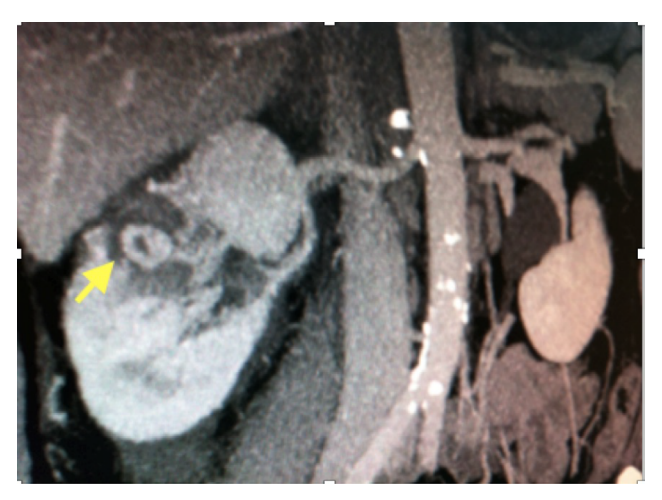
Figure 2 Computed tomography image of the patients' right kidney. Note: The yellow arrow pointing to the renal artery pseudoneurysm.

was 90 minutes, and warm ischemia time was 13 minutes. Floseal hemostatic matrix was applied over the suture line. The patient had an uneventful recovery and was discharged on the second postoperative day after Jackson Pratt drain removal. Histopathology confirmed moderately differentiated clear cell carcinoma with negative resection margins.