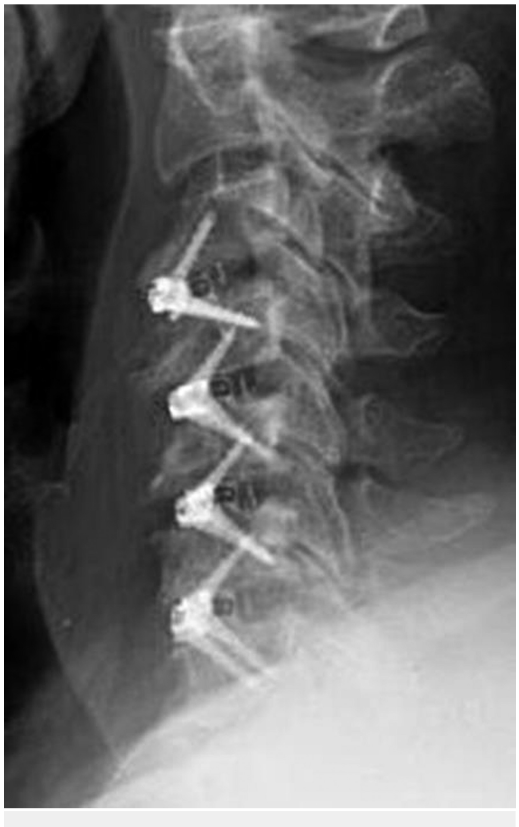
FIGURE 2: Case Example of a Four-Level ACDF Using the

Figures 2-3 demonstrate the postoperative imaging. The most commonly instrumented levels were the C4-C5 level (n= 33) and the C5-C6 level (n=32), followed by the C6-C7 level (n=25), then the C3-C4 level (n=14), and only one cage at the C2-C3 level.