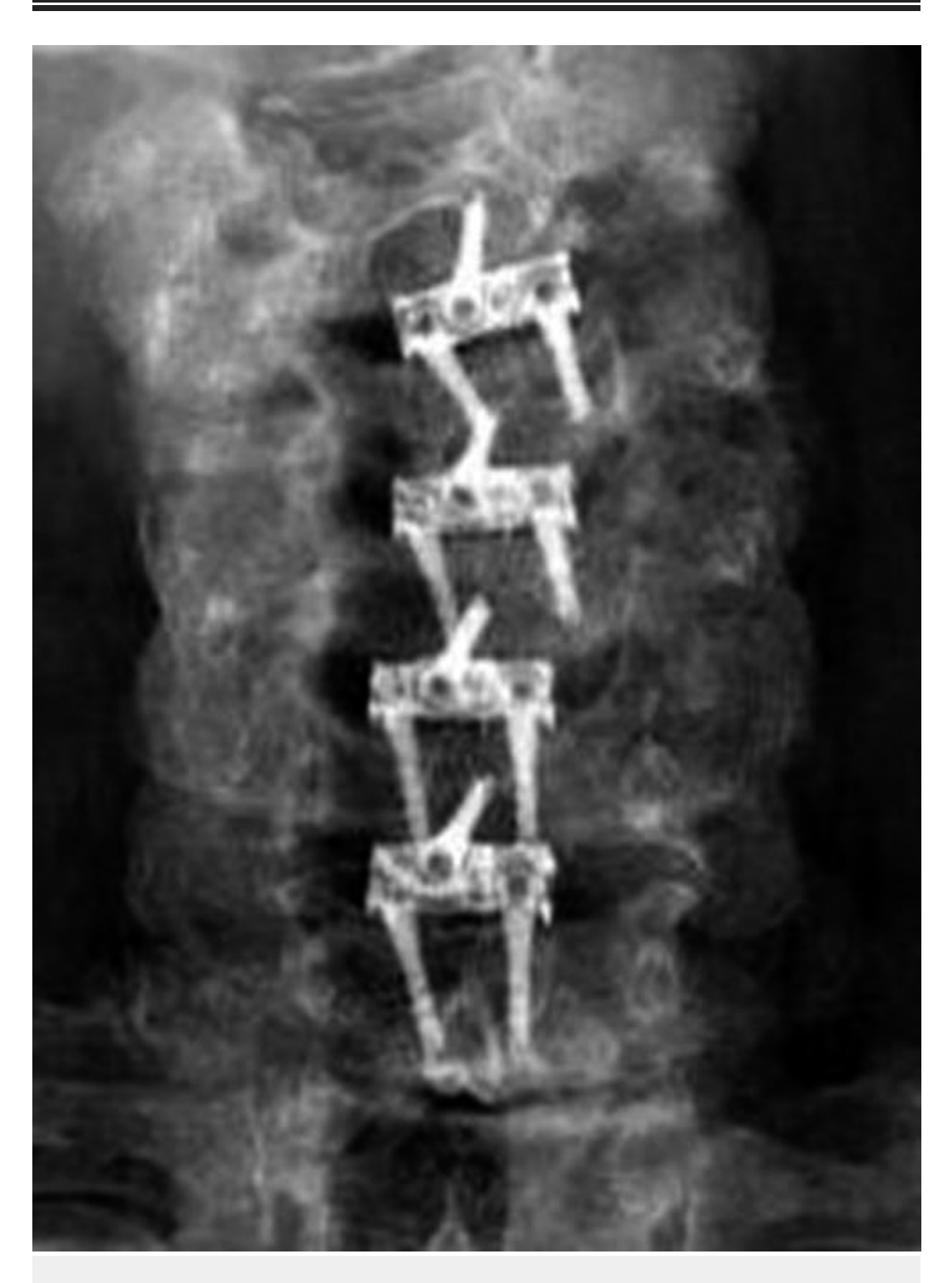
FIGURE 3: Case Example of a Four-Level ACDF Using the Optio-C Implant

Sagittal radiograph at three months after surgery demonstrating preservation of disc heights.