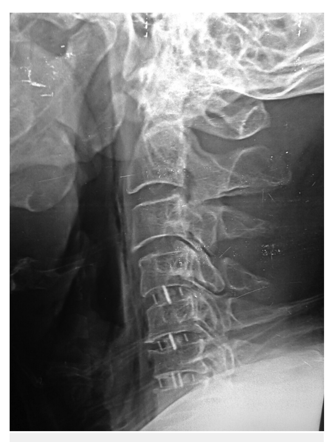
FIGURE 5: Case Example of a Three-Level ACDF Using Stand-

Figures 5-6 demonstrate the postoperative imaging. The most commonly instrumented levels were the C4-C5 and C5-C6 levels (n=35 for each), followed by the C3-C4 level (n=22), and then the C6-C7 level (n=18).