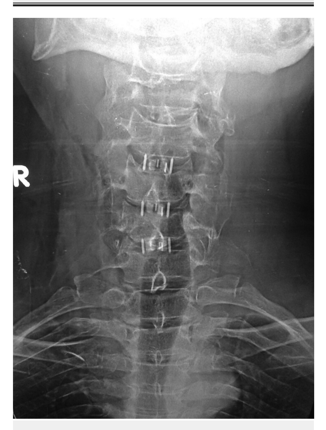
FIGURE 6: Case Example of a Three-Level ACDF Using Stand-Alone PEEK Cages

Sagittal radiograph at three months after surgery demonstrating hardware placement and preservation of disc space heights.