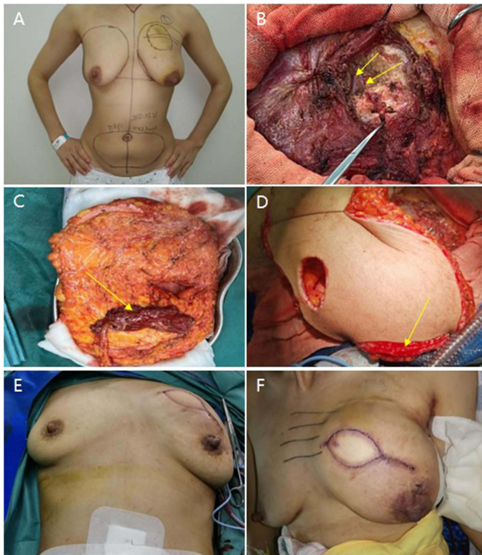
Figure 1 Sequential Stages of the DIEP Breast Reconstruction Surgical Procedure. (A) The initial stage involves preoperative markings which denote the tumor location and the range for flap excision. (B) This image highlights the vessels in the recipient area: The intra-thoracic arteries and veins are revealed within the 3rd rib space, as shown by arrows indicating 1 artery and 1 accompanying vein. (C) Post the freeing of the donor flap, the primary trunk of the subabdominal vessels becomes visible. A small section of the rectus abdominis muscle is observed wrapping around the vessel tips, also indicated by arrows. (D) After the vascular anastomosis, the image, guided by arrows, illustrates the flap edges exhibiting bleeding but with good blood flow after the removal of the epidermis. (E) Here we see the reconstructed breasts post shaping, with the bilateral breasts demonstrating basic symmetry. (F) The final image shows the status of the flap 1–5 days post-surgery, with a stable blood flow apparent.

Considering the extensive nature of the disease, characterized by multiple lumps and a predominance of high-grade intraductal carcinoma, along with the absence of preoperative lymph node involvement in the ipsilateral axilla, neoadjuvant chemotherapy was considered unnecessary. The extensive nature of the lesions also made breast-conserving surgery an unsuitable option. The patient's medical history revealed significant breast ptosis, as shown in Figure 1 , following the birth of two children, with no plans for further pregnancies.