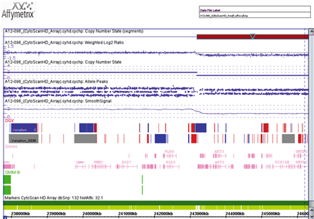
Figure 4. Chromosomal microarray revealed 1q43q44 (arr 1q43q44(243,204,375-249,224,684)×1).

mass in the midline, occupying much of the third ventricle. Differential diagnoses include: choroid plexus papilloma or carcinoma, ependymoma, or germ cell tumor. Dysgenesis of the corpus callosum was also incidentally noted on this MRI scan. An awake/sleep EEG performed at 14 months of age due to an episode of apnea and cyanosis revealed slow waves and diffuse encephalopathy, but was negative for seizure activity. Significant developmental delays have been noted since birth. At the most recent genetics evaluation at 17 months of age, he was functioning at the level of a 4-month-old. At 23 months, he was functioning at the level of a 2- to 3-month-old per the family's assessment.