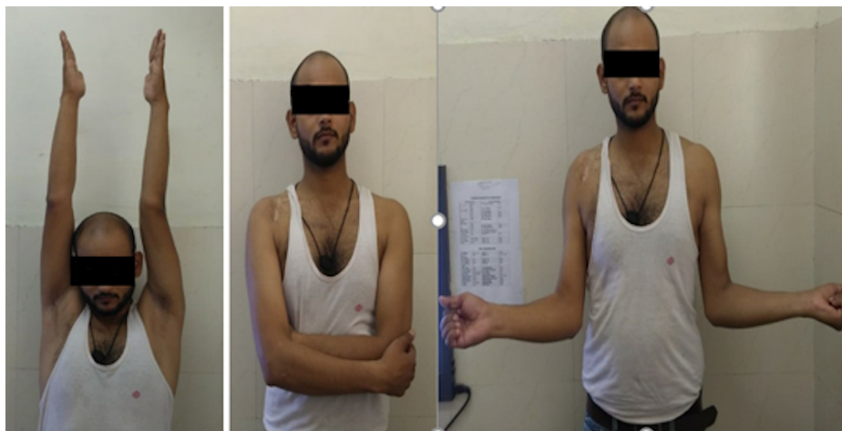
FIGURE 3: Range of motion of the shoulder at one-year follow-up.

Radiological assessment was also done at each visit with an anteroposterior radiograph with a 15-degree cephalic tilt (Zanca view) along with an axillary shoulder view to ascertain the reduction of fracture fragments and position of the implant [13]. Contralateral shoulder radiographs were obtained in all cases for comparison. The coracoclavicular distance was measured on both normal and operated sides. Union at fracture site was confirmed radiologically by the continuity of cortex on three sides and medullary cavity reconstitution. Clinically, the absence of tenderness at the fracture site was considered as evidence of union (Figure 4).