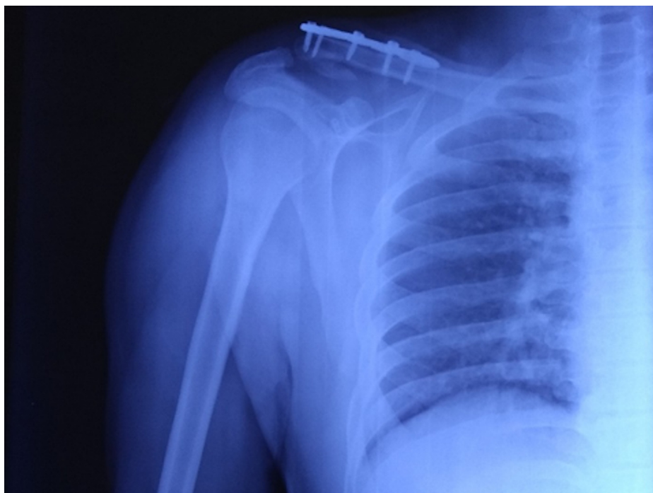
FIGURE 4: AP radiograph of the shoulder at one-year follow-up showing union of the lateral end of clavicle.

Radiological assessment was also done at each visit with an anteroposterior radiograph with a 15-degree cephalic tilt (Zanca view) along with an axillary shoulder view to ascertain the reduction of fracture fragments and position of the implant [13]. Contralateral shoulder radiographs were obtained in all cases for comparison. The coracoclavicular distance was measured on both normal and operated sides. Union at fracture site was confirmed radiologically by the continuity of cortex on three sides and medullary cavity reconstitution. Clinically, the absence of tenderness at the fracture site was considered as evidence of union (Figure 4).