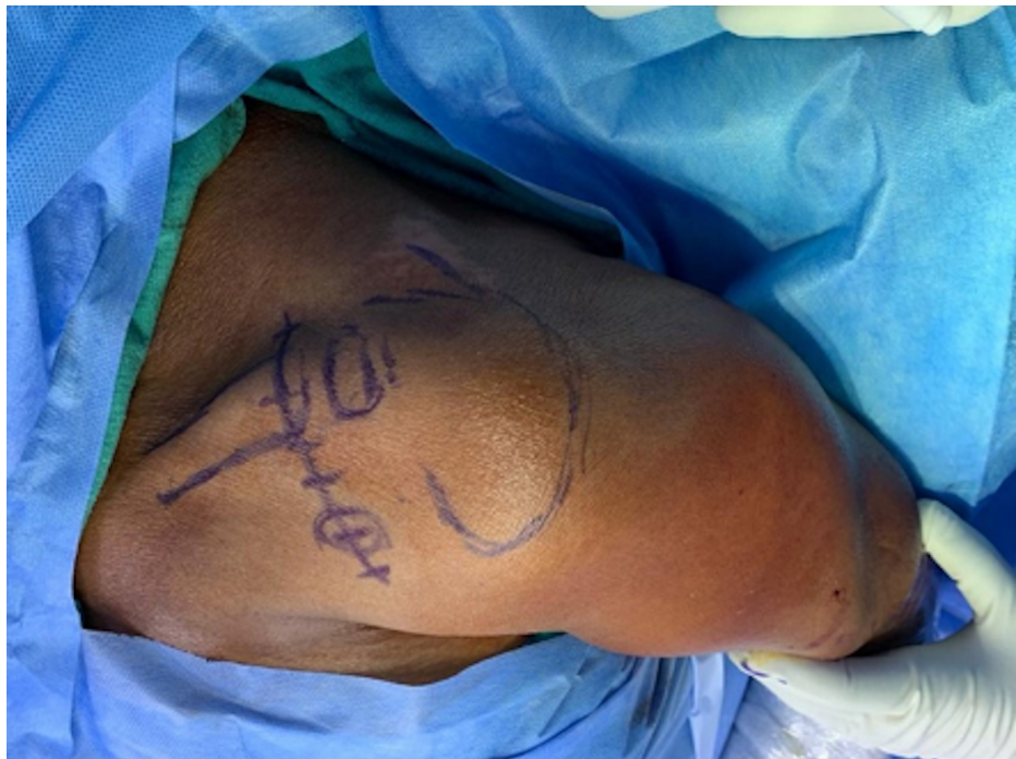
FIGURE 2: 'Bra strap' incision from the tip of the coracoid process to anterosuperior aspect of the lateral third of the clavicle.

Medial and lateral flaps were developed. The deltotracheal fascia was then incised perpendicular to the skin incision and released from the clavicle. The fracture ends were then exposed. The coracoid was also exposed. Dissection medial to the coracoid was avoided to prevent inadvertent damage to neurovascular structures. A tunnel was made at the coracoid base centrally about 1.5 cm from its tip using a 2.5mm drill bit. Another bony tunnel was made in the clavicle just above the coracoid slightly anterior to the midline. Then, an endobutton (12 mm x 4 mm, Arthrex) loaded with a single No. 2 fiberwire 38" suture was passed under the coracoid and the clavicle tunnel in a retrograde fashion so that the endobutton catches on the undersurface of the coracoid and two ends of the suture come out of the clavicle which can be later tied to the distal clavicle plate. The fracture ends were reduced and fixed with a pre-contoured locking distal clavicle plate. When at least one screw was applied on either side of the fracture the two ends of the suture were tied with the distal clavicle plate. At least three screws (3.5mm cortical/locking) were applied medial to the fracture and three to four screws (2.7 mm locking) lateral to the fracture. Proper hemostasis was achieved and the wound was closed in layers. No drain was applied. The arm was immobilized in an arm pouch.