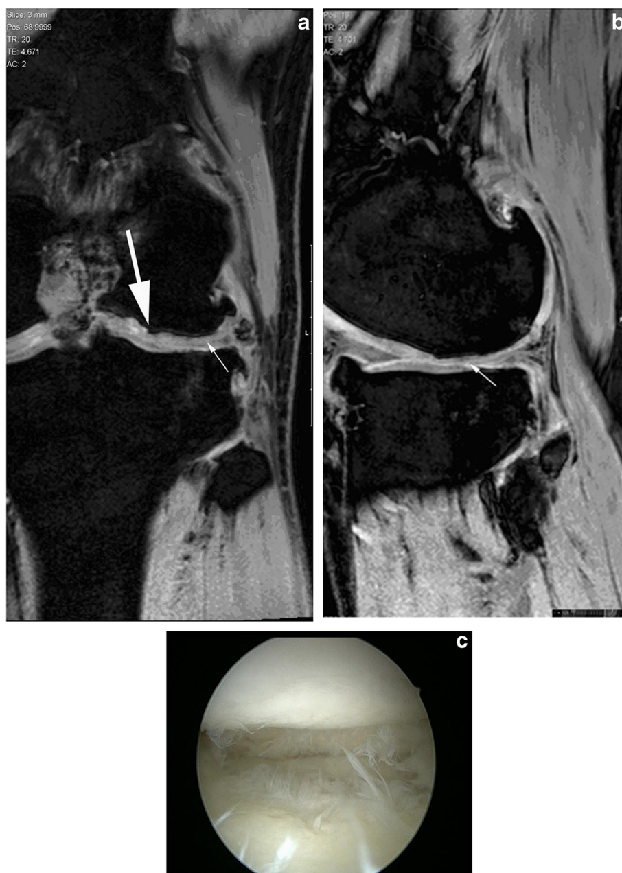
Figure 2 Second year follow-up magnetic resonance imaging. (a) Coronal and (b) sagittal three-dimensional gradient echo T1 (WATSf; repetition time 20, echo time 5.2, field of view 150, fractional anisotropy 15°, slice thickness 3 mm) left knee magnetic resonance images demonstrate the morphology of the cartilage implant. The graft is well integrated with a thickness that is similar to that of the adjacent cartilage; the graft surface is smooth (arrow). Mildly decreased signal intensity and artifacts are observed in the graft compared with the adjacent cartilage. Underneath, the large graft irregular bone contour (thick arrow) and osteophyte formation at bony margins is also noted. (c) Second-look arthroscopy at two years demonstrated complete filling of the defect and excellent integration of the newly formed cartilage with native tissue.

stimulation techniques [5]. However, donor site morbidity following the treatment of large defects may limit clinical usage of this method. Bentley et al. showed significant superiority of ACI over mosaicplasty for the repair of knee articular cartilage defects in a prospective, randomized, clinical trial with 60 patients [6]. Modified Cincinnati and Stanmore scores and objective clinical