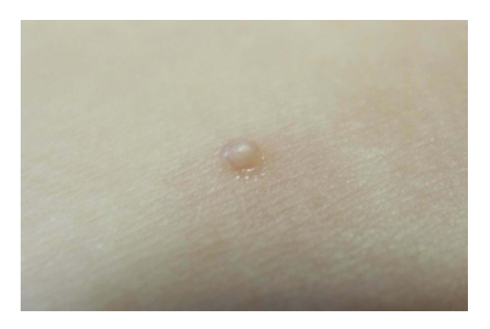
Figure I Firm, rounded, skin-colored papules with a shiny and umbilicated surface.

Patients may develop eczematous plaques around one or more lesions of MC, a phenomenon known as "molluscum dermatitis" (MD) or "eczema molluscorum" (EM) which is more frequent in patients with AD. It is estimated that 9-47% of the patients with MC develop MD.<sup>25</sup> It is