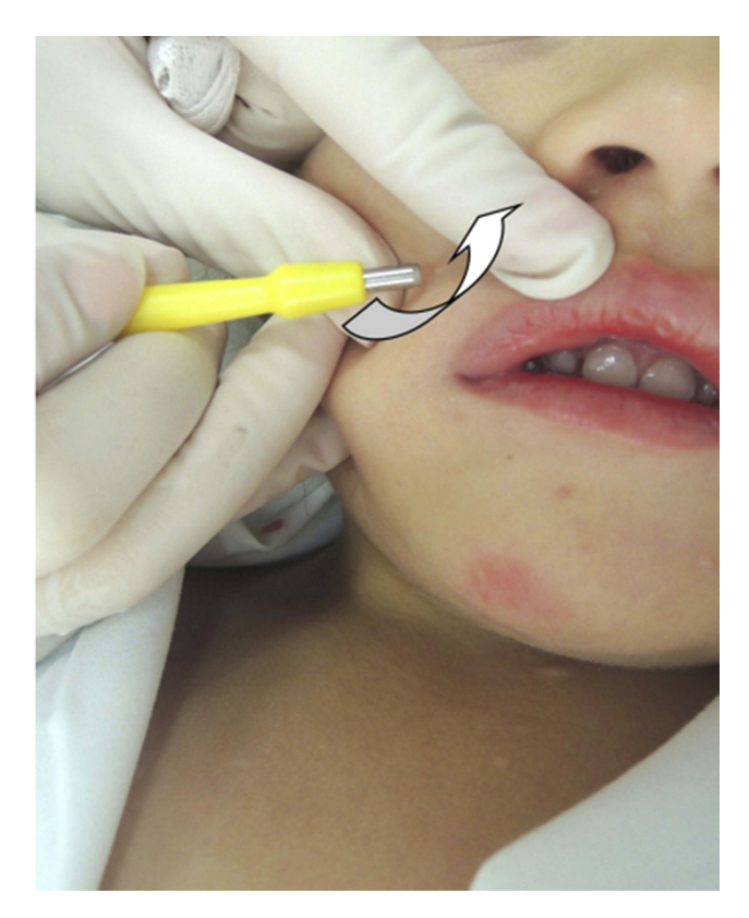
Figure 5 Mechanical removal (curettage) of a molluscum contagiosum with a punch tool. The punch should be positioned in <30^{\circ} to the skin surface and a shear movement should be performed to remove the molluscum in its entirety.

Another useful mechanical method is pulse dye laser therapy, which due to its costs and limited availability is suggested to be left for refractory cases.<sup>1,63</sup> It is an