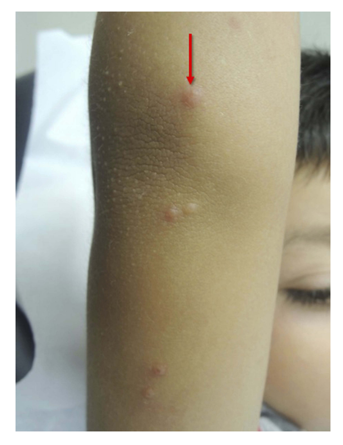
Figure 2 Swelling and erythema of the "BOTE" sign.

not clear whether the treatment of MD with topical corticosteroids impacts the resolution of MC lesions.<sup>35,36</sup>