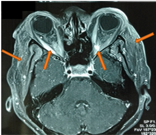
Fig. 2. : Orbital MRI: Diffuse inflammation intra and extra orbital infiltrating peri-orbital soft tissues, oculomotor muscles and optic nerves.

diagnosis of mucormycosis was suspected. Thus the corticosteroid therapy was stopped and the V-fend was replaced by Amphotericin B (AMB: 1 mg/kg/day) (on day 52) associated to antibiotic therapy. However, no improvement was seen. The last cutaneous biopsy of the cheek was sent to the parasitology laboratory on day 60 and isolated in culture Alternaria sp. The diagnosis of facial alternariosis has been made. But unfortunately the evolution was fatal despite antifungal treatment (she totalized 8 days of AMB).