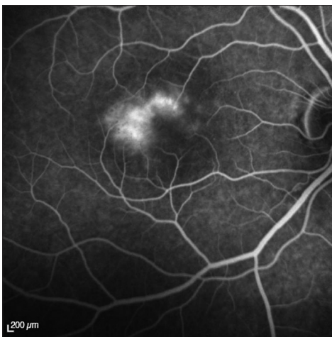
Figure 1: Late frame from a fluorescein angiogram of an eye with macular telangiectasia type 2 showing the typical late leakage that does not involve the foveal center

Indocyanine green angiography (ICG-A) is the imaging modality of choice of the choroidal circulation. There are no MacTel 2 specific findings on ICG-A. [25] This should not come as a surprise since MacTel 2 spares the choroid and choriocapillaris.