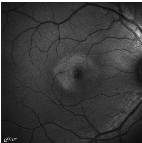
Figure 3: Increased confocal blue reflectance

All the available evidences point to the Müller cell as a central player in MacTel 2. The findings on AO imaging clearly demonstrates that neural degeneration precedes retinal vascular involvement. [49] The increased SW-AF signal in the fovea also precedes the FA changes. Histopathological findings show that the RPE is healthy in MacTel 2. [53,54] Thus, the increased SW-AF signal is most likely due to the depletion of luteal pigment rather than an increased lipofuscin accumulation in the RPE. Müller cells serve as a retinal reservoir for xanthophyll. Therefore any pathological process that involves Müller cells will affect the luteal pigment. [55] The increased CBR signal also implicates Müller cells. The increased CBR may be explained by four different mechanisms. First, since the absorption maximum of macular pigment is in the range of blue light at approximately 460 nm, decreased absorption or increased reflection of the blue light may be secondary to a decrease in macular pigment in the parafoveal area. [22,56] Second, Müller cells span the entire retinal thickness and may serve as optical fibers that allow transmission with a minimal reflection of light across the retina. Any pathological involvement of Müller cells would interrupt this mechanism and decrease