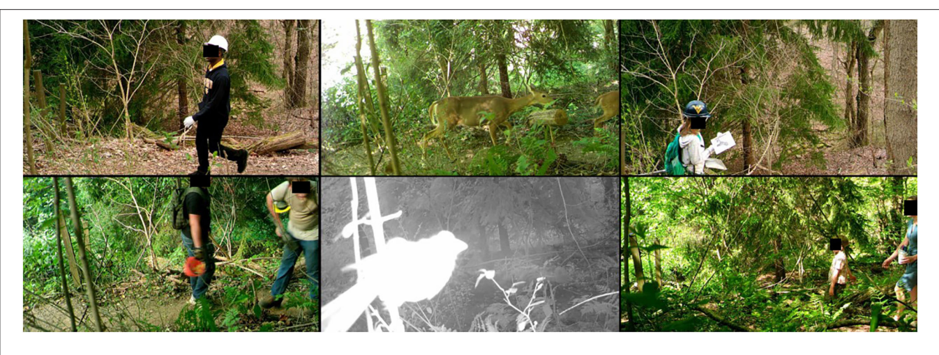
FIGURE 3 | Example images from passive infrared camera field test.

TABLE 1 | Trail user characteristics based on coding of images from a PIC on a hiking trail.