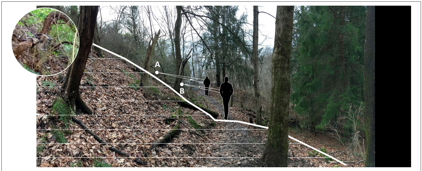
FIGURE 2 | Image depicting the field test location, looking toward the trail entrance, with the location of the PIC (A) and infrared trail sensor (B) noted. The PIC was 3 m from the trail edge and the sensor was 1 m from the trail edge. The inset photo is an image of the PIC mounted to sturdy grape vine at location (A). PIC, passive infrared camera. Bold line shows cross section of topography at infrared sensor location (foreground). Horizontal lines denote 0.6-m contours.