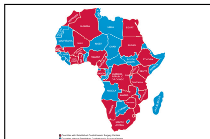
Map depicting countries of Africa with established CTS centers and training programs.

Conclusions: Cardiothoracic surgery in Africa has faced great challenges due to resource constraints, but it has demonstrated resilience and growth through diverse models and initiatives. The burden of cardiovascular diseases in Africa remains high, yet the capacity to provide cardiothoracic surgery is limited. With investment, support, and the implementation of comprehensive healthcare policies, cardiothoracic surgery practice can improve in this region and this can make a significant impact on the health and well-being of its population. (JTCVS Open 2024;19:370-7)