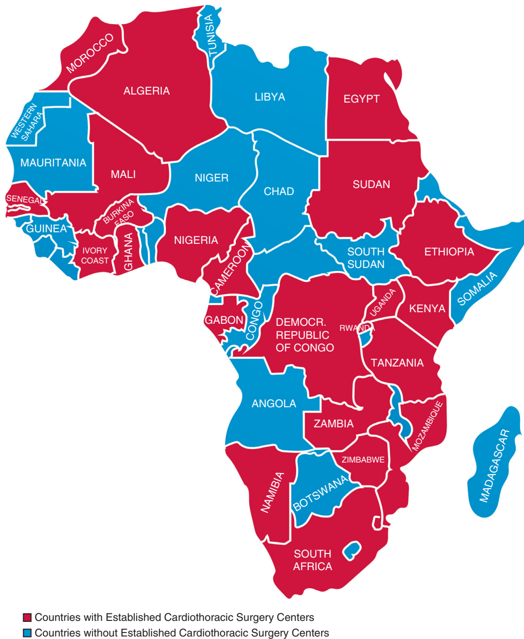
FIGURE 1. Map showing African countries with established CTS centers.

number of cases that are handled locally, as well as standard training programs in regions such as South Africa, West Africa, and North Africa. 17,18 Additionally, innovative techniques in surgery have begun to appear in a few countries, such as a robot-assisted surgery programs at Netcare Christian Barnard Memorial Hospital and video-assisted thoracic surgery and mediastinoscopy in Nigeria. 19-21