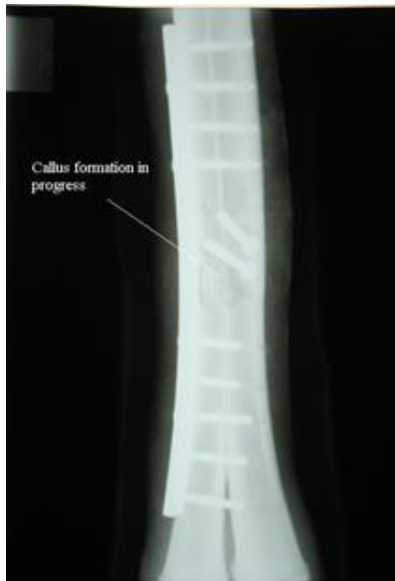
Fig. 3. Dorso-plantar radiograph (eight weeks post-operation). Callus formation in progress.

The animal recovered from injury without major complications except slight lameness after 16 weeks of surgery, but was able to bear full weight on the affected leg when the forelimb of the same side was picked up. The radiographic pictures two and four weeks after surgery revealed that the plate and screws were in place while radiographic examination eight weeks after surgery was indicative of good progress of callus formation (Fig. 3). The radiograph 16 weeks after surgery was indicative of a bridging callus (Fig. 4).