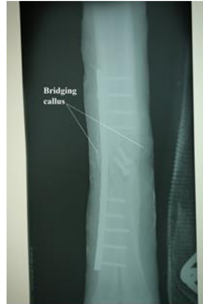
Fig. 4. Dorso-plantar radiograph (16 weeks post-operation). Note the bridging callus.

postoperative weeks and keeping the animal in a separate enclosure with restricted activity played an important role towards smooth healing of the fracture as also described by Newman and Anderson (2009) and Siddiqui and Telfah (2010).