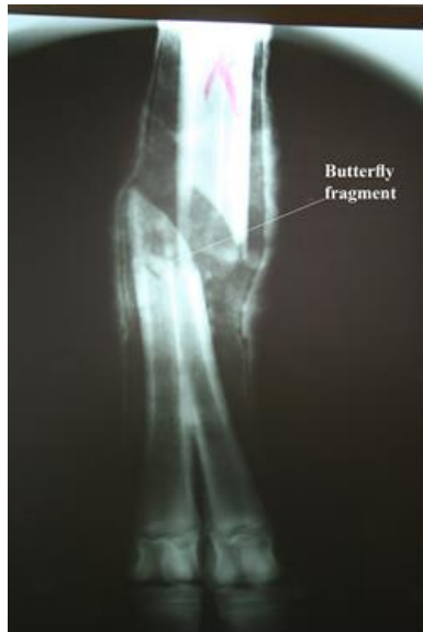
Fig. 1. Preoperative dorso-plantar radiograph of the dromedary heifer's metatarsus.

the lateral aspect of the metatarsal region starting distally from the hock joint up to above the fetlock joint to expose the fracture site. The fracture was reduced and held with the bone holding clamp. Interfragmental compression was achieved through two 4.5 mm cortical screws in cranio-caudal direction. These screws were used in the lag effect as described by (Smith et al. , 1996; Siddiqui and Telfah, 2010).