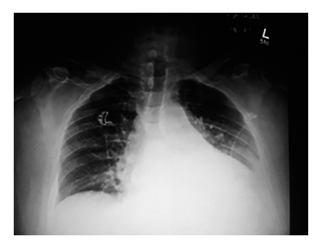
Figure 4. Chest X-ray showing enlargement of the cardiac silhouette and left-sided pleural effusion with accompanying atelectasis.