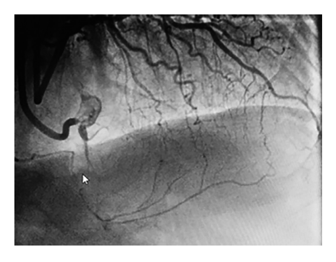
Figure 1. Total occlusion of the right coronary artery (RCA) with left to right collateral via septal arteries.

Intecc, Nagoya, Japan) guidewires were used to cross the occlusion, eventually obtaining an adequate position to perform a reverse CART procedure. After we predilated the subintimal space with a 3 \times 15 mm Trek balloon (Abbott Vascular, Santa Clara, CA), we were able to access into the antegrade guide and then externalize a R350 wire (Vascular Solutions, Minneapolis, MN). Three drug-eluting stents were used to stent from the ostial RCA to the RCA crux: 2.5 \times 38 mm, 3.0 \times 38 mm, 3.0 × 20 mm Promus Premier (Boston Scientific, Marlborough). Postdilatation was performed with 2.75 \times 15 mm and 3.0 \times 15 mm noncompliant Trek balloons (Abbott Vascular, Santa Clara, CA) (Fig. 2). There were no angiographic or clinical complications during the procedure. We maintained all major branches of the RCA. At the end of the procedure, a bedside echocardiogram was performed, which showed no evidence of mechanical complication or pericardial effusion.