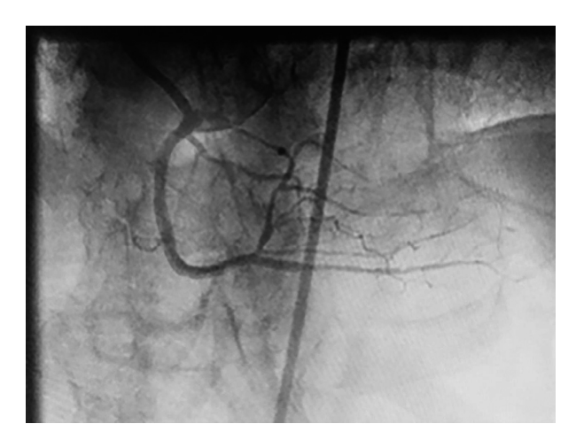
Figure 2. Successful stenting with three drug-eluting stents.

Intecc, Nagoya, Japan) guidewires were used to cross the occlusion, eventually obtaining an adequate position to perform a reverse CART procedure. After we predilated the subintimal space with a 3 \times 15 mm Trek balloon (Abbott Vascular, Santa Clara, CA), we were able to access into the antegrade guide and then externalize a R350 wire (Vascular Solutions, Minneapolis, MN). Three drug-eluting stents were used to stent from the ostial RCA to the RCA crux: 2.5 \times 38 mm, 3.0 \times 38 mm, 3.0 × 20 mm Promus Premier (Boston Scientific, Marlborough). Postdilatation was performed with 2.75 \times 15 mm and 3.0 \times 15 mm noncompliant Trek balloons (Abbott Vascular, Santa Clara, CA) (Fig. 2). There were no angiographic or clinical complications during the procedure. We maintained all major branches of the RCA. At the end of the procedure, a bedside echocardiogram was performed, which showed no evidence of mechanical complication or pericardial effusion.