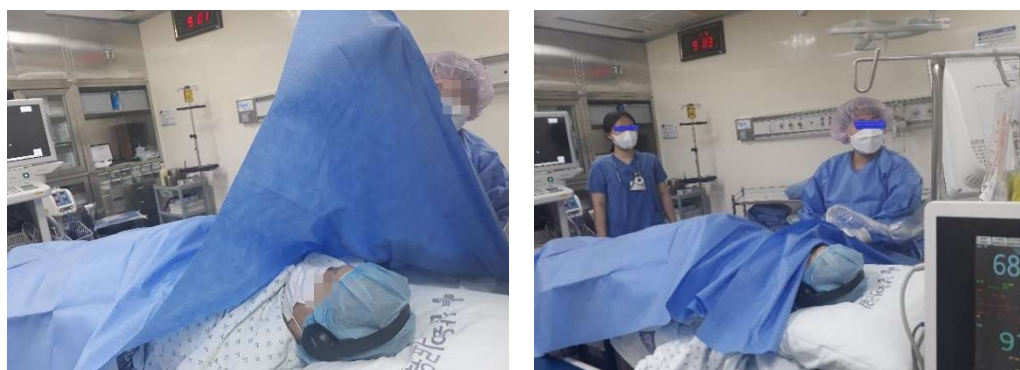
Figure 1. Vascular access surgery with music therapy.

The experimental group was instructed to listen to their favorite music using a Bluetooth headset during vascular access surgery. In this study, as a preparatory process for music therapy, the types of music that each subject liked were investigated in advance. Based on this, after paying for the official sound source on the Internet ‘Melon’ music site, it was downloaded to a mobile phone or MP3 player. The number of preferred songs required for the 30 min intervention was about 10 to 12 songs. During the vascular access surgery procedure, the experimental group used Bluetooth headphones to listen to their preferred music so as not to interfere with the procedure (Figure 1). The volume level was maintained at a level that allowed communication to be carried out while listening to music. The control group performed vascular access surgery in a quiet environment without music intervention. The detailed music medicine procedure is shown in (Table 1).