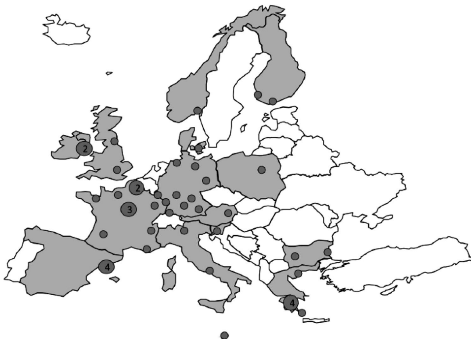
Fig. 1 Participating countries into EuroNHID project (in gray) and location of surveyed isolation facilities (dark gray dots). Numbers indicate the number of facilities in the same city

All on-site visits were performed by the project coordinator together with a representative of the surveyed