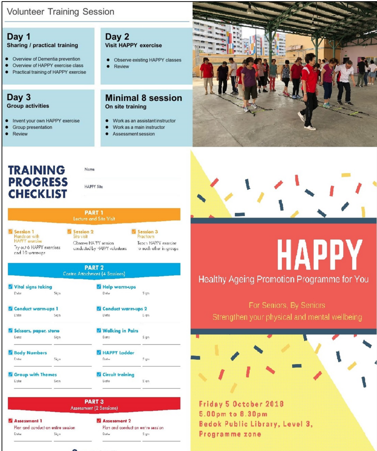
Figure 2. Training program. HAPPY: Healthy Ageing Promotion Program for You.