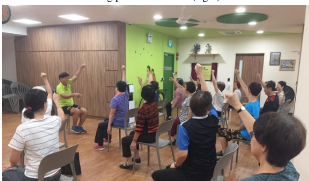
Figure 1. The Healthy Ageing Promotion Program for You (HAPPY) conducted on-site at community centers pre-COVID-19 (left) and in outdoor spaces with social distancing post-COVID-19 (right).

Our paper describes technology acceptability in older adults who were undergoing an on-site frailty intervention that subsequently transitioned into digital form. The Healthy Ageing Promotion Program for You (HAPPY) dual-task exercise program was first rolled out in 2017. The program was adapted from Cognicise and is a group multicomponent exercise focusing on cognition and physical function, originating from the National Center for Geriatrics and Gerontology in Nagoya, Japan. Prior to the COVID-19 pandemic, this program was ongoing in more than 50 different sites with at least 700 participants across Singapore and has shown to reverse frailty and improve cognition [8] (Figure 1).