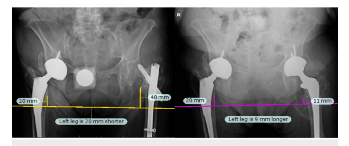
FIGURE 3: Radiographs for Case 3.

Following consultation with the patient, the perioperative plan consisted of a conversion of the previous surgery and intertrochanteric mal-union to a THA, with soft tissue release and removal of the previous heterotopic bone. An imageless navigation system was used in order to help restore leg length and set the cup abduction and version given the large leg length discrepancy, massive heterotopic ossification, and destruction of the native acetabular anatomy. Surgery was successful and the patient was discharged to a rehabilitation facility with the assistance of only a walker. She described meaningful pain relief and was content with the outcome of her surgery. Within six weeks of follow-up, the patient had transitioned to a walker from the wheelchair and at three months follow-up the patient was walking without pain in the right hip. The right leg was lengthened by 30 mm, resulting in equalized leg lengths and well-aligned hips (Figure 3 ).