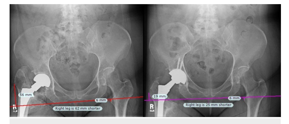
FIGURE 2: Radiographs for Case 2.

Following consultation with the patient, the preoperative plan included a revision of the hemiarthroplasty and conversion to a right hip THA. During surgery, computer-assisted navigation was again used to assist with component placement and monitoring of changes in leg length. Surgery was successful and the patient did well post-operatively. She reported significant pain relief and was satisfied with the outcome of her surgery. Radiographs revealed equalized leg lengths and implants were well aligned. The patient was able to ambulate by three months post-procedure without any assistive devices. Her foot drop from the index surgery remained stable and improved slightly over the next year. A leg lengthening of 35 mm was confirmed on post-operative radiographs, resulting in a post-operative LLD of 2 mm. At one year the patient was back to her normal functional status prior to her hip fracture (Figure 2 ).