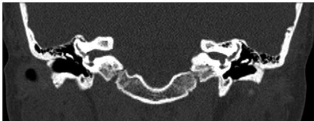
Figure 1: Coronal view showing the exostosis in the internal auditory canal. The red circle shows how the left is severely narrowed as compared to the right

Surgery was performed in lateral position, with the left side up [Video 1]. A spinal drain was placed to aid with brain relaxation. A curvilinear incision was made behind the ear for a retromastoid approach. A standard suboccipital craniectomy was fashioned. The cisterna magna was decompressed by allowing cerebrospinal fluid to drain through the spinal drain. The brain was retracted medial and inferior to the seventh and eighth cranial nerve complex. After splitting the arachnoid, the exostoses were visible on the base of the porus acousticus below the anterior inferior cerebellar artery and appeared to be directly compressing the intermediate nerve. At this point, with the assistance of the neurotologic surgeon, the bone was drilled with a series of diamond drills until it was flat. Thereafter, Teflon was laid between the bone and the seventh and eighth cranial nerve complexes. Intraoperative monitoring