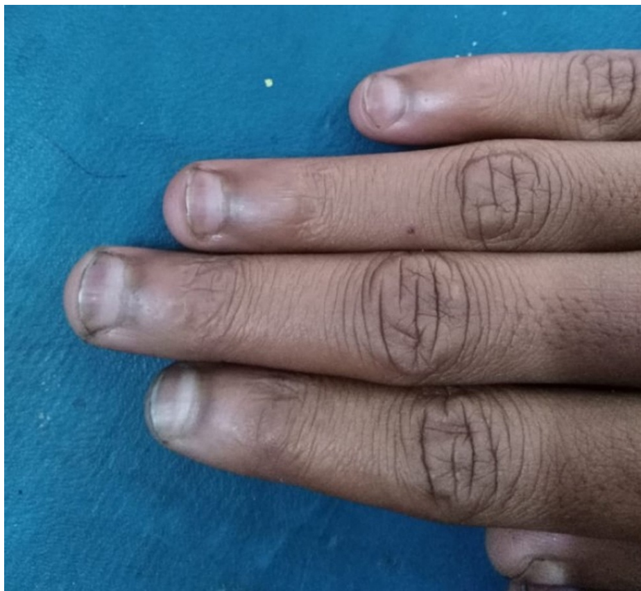
FIGURE 1: This image highlights the “half and half” or “Lindsay’s nails,” which are characterized by a white discoloration of the proximal portion of the nail along with the distal half red, pink, or brown, with a sharp line of demarcation between the two portions. This is a nonspecific finding however and was found on all 10 digits.