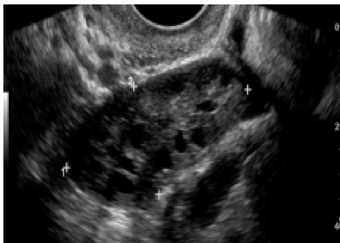
Fig. 3: A female with PCO, showing appearance of multiple follicles peripherally arranged peripherally on dense stroma.

distribution. In obese with PCOS 33% showed normal morphological pattern ( p > 0.05 ). while (67%) showed a picture of PCOS more than 10 cysts in 2–8 mm in diameter arranged around an echodense stroma (Fig 3).