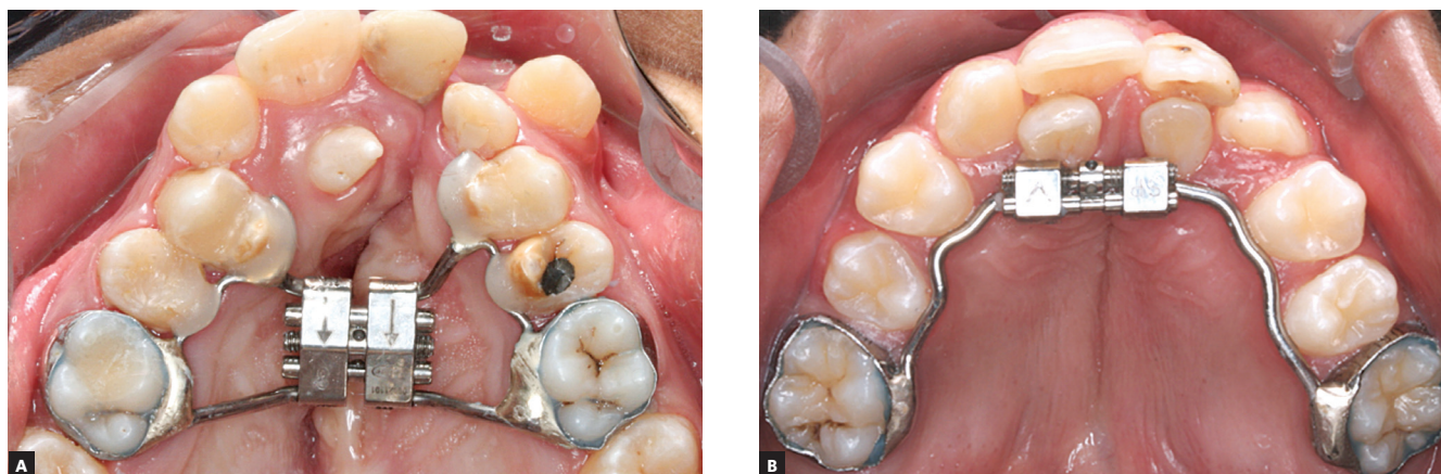
Figure 1 - Rapid maxillary expanders evaluated: A) modified Hyrax; B) inverted mini-Hyrax (iMini).

The methods were similar to those used in our previous study. 17 A pretreatment cone-beam computed tomographic image (CBCT) ( T_0 ) was taken as part of the initial orthodontic records of all patients. The activation regimen was established at two turns/day until the tip of the lingual cusp of maxillary teeth touched the tip of the buccal cusp of mandibular teeth. The ap-