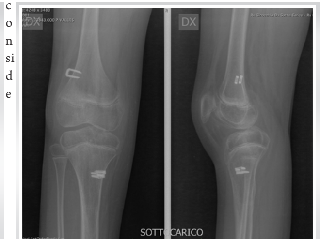
Figure 5: Post-operative weight-bearing X-ray of the right knee at 6 months follow-up anteroposterior (left) and lateral (right) views. These show that, due to the correct positioning of ACL graft, there was a successful reduction of the knee subluxation and an increase in joint alignment. In these images, it's also possible to observe the four metal staples, used to fix the graft, perfectly in place 6 months after surgery.