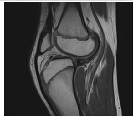
Figure 2: Pre-operative MRI of the right knee in sagittal view. It's possible to observe the agenesis of ACL and PCL resulting in an anterior dislocation of the tibia and consequent joint instability with functional limitation.