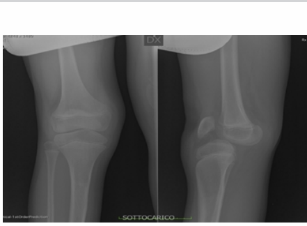
Figure 1: Pre-operative weight-bearing X-ray of the right knee. This right knee radiograph in anteroposterior (left) and lateral (right) view allows the evaluation of the anterior dislocation of the tibia.