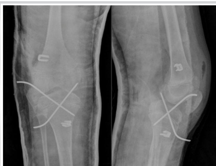
Figure 4: Post-operative X-ray of the patient's right knee. This plain radiograph shows the K-wires placed to stabilize the joint on an anteroposterior (left) and lateral (right) views.

After discussing with the patient and his parents and