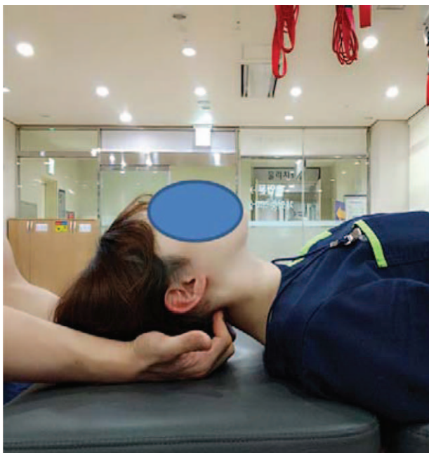
Figure 3. Suboccipital release.