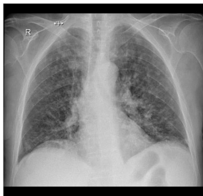
Figure 1. Chest X-ray from a 72-year old female patient with rheumatoid arthritis, obtained following 6 months of treatment with 40 mg/day adalimumab, every 2 weeks: X-ray shows multiple pale nodular opacities disseminated bilaterally, particularly in the upper two thirds of the thorax