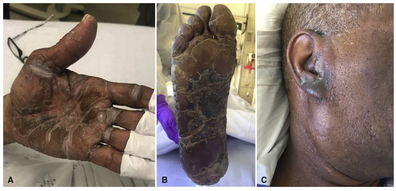
Fig 2. Clinical image taken at time of hospitalization. A , Hyperkeratotic plaques and fissuring of left palm. B , Hyperkeratotic plaques and fissuring of right plantar foot. C , Hyperpigmented plaque over right ear.