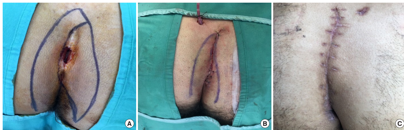
Fig. 1. Bascom cleft-lift procedure. (A) Eccentric skin ellipse excision. (B) Superficial flaps are established to reduce the depth of the gluteal cleft and to shift the suture line off the midline. (C) The wound after 6 weeks.

The pits picking (Gips) procedures [18, 20] were all carried out in the prone position under a general and local anesthesia combi-