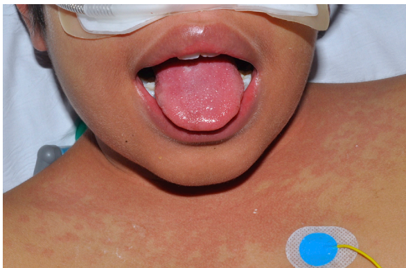
Fig 4. Multisystem inflammatory syndrome. Macular and papular eruption on the neck and strawberry tongue.

The presence of any mucocutaneous lesion in febrile children in the current epidemiologic context should prompt interrogation about close contacts with suspected or confirmed COVID-19 cases. The association of other symptoms, especially gastrointestinal complaints, should alert the pediatrician to the possibility of a severe COVID-19 case. The natural 4- to 5-week gap between SARS-CoV-2 infection and the development of MIS-C symptoms warrants monitoring of affected individuals. 19 Attention to vital signs is key, because extreme tachycardia is a common early sign of shock. Initial blood tests should include full blood count, C-reactive protein, urea, creatinine, electrolytes, and liver function. If results from these tests support a diagnosis of MIS-C, additional investigation is recommended to determine the diagnosis and severity of the disease. 20