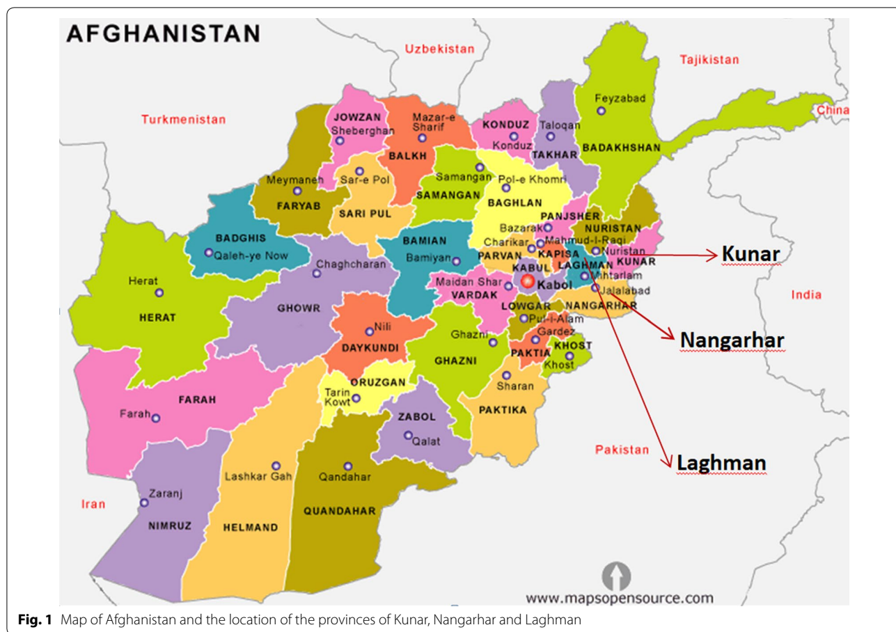
Fig. 1 Map of Afghanistan and the location of the provinces of Kunar, Nangarhar and Laghman