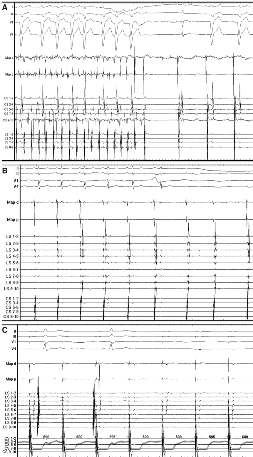
Figure 1. A, Atrial fibrillation termination into sinus rhythm during ablation of an extra-pulmonary vein (PV) source at the anterior left atrium. The rapid local activity in the ablation catheter with complex fractionated electrogram configuration and activation gradient between distal and proximal bipoles. Immediately before atrial fibrillation terminates, the local fractionated electrograms convert into more discrete signals along with local cycle length slowing. B, Induction of dormant conduction induced by the application of 15-mg adenosine. C, Adenosine application after electric isolation of a left superior PV showing dissociated activity. With the occurrence of complete AV block, the dissociated rhythm disappeared and the PV remained isolated without the occurrence of dormant conduction. II, III, V 1 , and V 4 are surface ECG leads; CS indicates coronary sinus; LS, Lasso catheter (placed in the left atrial appendage); and Map d and p, distal and proximal ablation catheter bipoles.