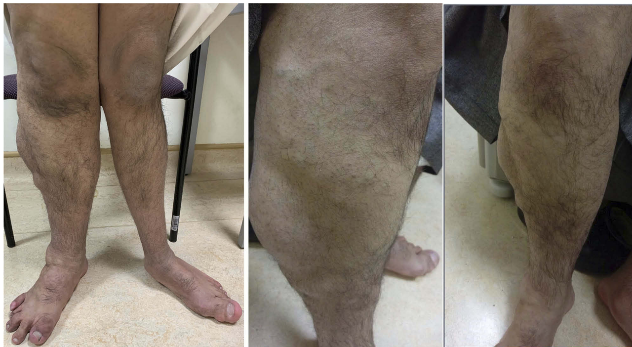
Figure 1 Composite figure depicting hemihypertrophy of the right lower limb and mega varicose veins.

The most likely diagnosis is Klippel-Trenaunay syndrome based on the presence of extensive lower limb varicosities, soft tissue hypertrophy with bone deformities, central nervous system arteriovenous malformation, and recurrent venous thromboembolism.