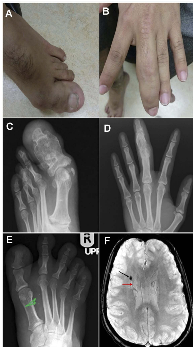
Figure 2 (A-D) The composite figure illustrates clinical and radiological findings, showing focal gigantism involving the left-hand middle finger phalanges and phalanges of the left big toe with their expansion and remodeling. (E) Axial susceptibility-weighted image showing right paraventricular cavernous venous malformation (black arrow) accompanied by an adjacent developmental venous anomaly (red arrow). (F) AP radiograph of the right foot exhibiting diffuse soft tissue hypertrophy with punctate dystrophic calcifications (green arrows) that reveal slow flow venous malformation.