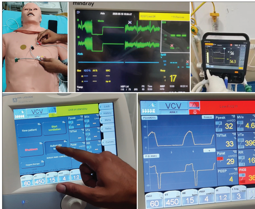
Figure 2: Still images of the troubleshooting video

This allowed the participants to stop and ask queries during the video. The shorter duration sessions with small batches could be repeated frequently to cover a large portion of the nursing manpower within a short period of time. Thus, this kind of hybrid technique might be more useful in refreshing knowledge of those students with some previous formal training on the subject, as in the current study where a rapid training schedule was required before an upcoming covid wave.