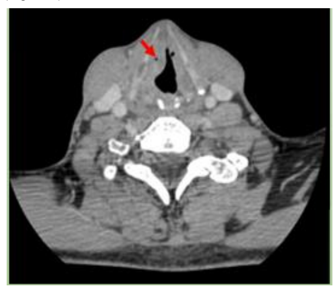
Figure 1: Computed Tomography of the neck showing soft tissue mass involving the right true vocal cord or glottis region (arrow)

examinations were unremarkable. Examination of the cervical lymph nodes showed two masses on level two and three on the left side of the neck. After that, the patient was admitted as a case of laryngeal mass and was booked for Computed Tomography (CT) of the neck with intravenous contrast and labs were taken. Also, an operating room was booked for the next day for the potential need for biopsy taking. The CT demonstrated a soft tissue mass involving the right true vocal cord causing mild narrowing of the airway (Figure 1).