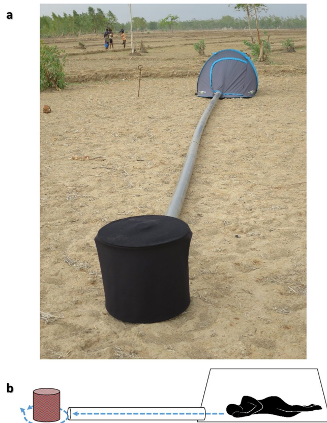
Figure 2. The Host Decoy Trap (a) Field assistants provide human odour while sleeping protected in a tent overnight. Fan draws air from tent along pipe, releasing odour ~10 cm from the base of the trap. Netting covers end of pipe to prevent mosquitoes entering tent. Trap kept at human body temperature ( 35 \pm 5^\circ\text{C} ). Un-patterned dark cloth covers trap to increase visual contrast. Clear adhesive plastic sheet wraps around trap to catch landing mosquitoes. Tent is 10 m from trap to focus mosquito search for visual host cues near trap rather than the tent. (b) Schematic, showing flow of air containing whole human odour (blue dashed line) from tent to surrounding Host Decoy Trap.